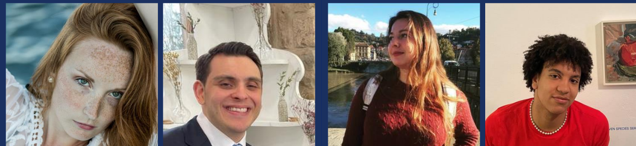
CONSIGLIO DEI GIOVANI ALCOTRA 2023-2024 UN'ESPERIENZA UNICA PER I PROGRAMMI EUROPEI TRANSFRONTALIERI