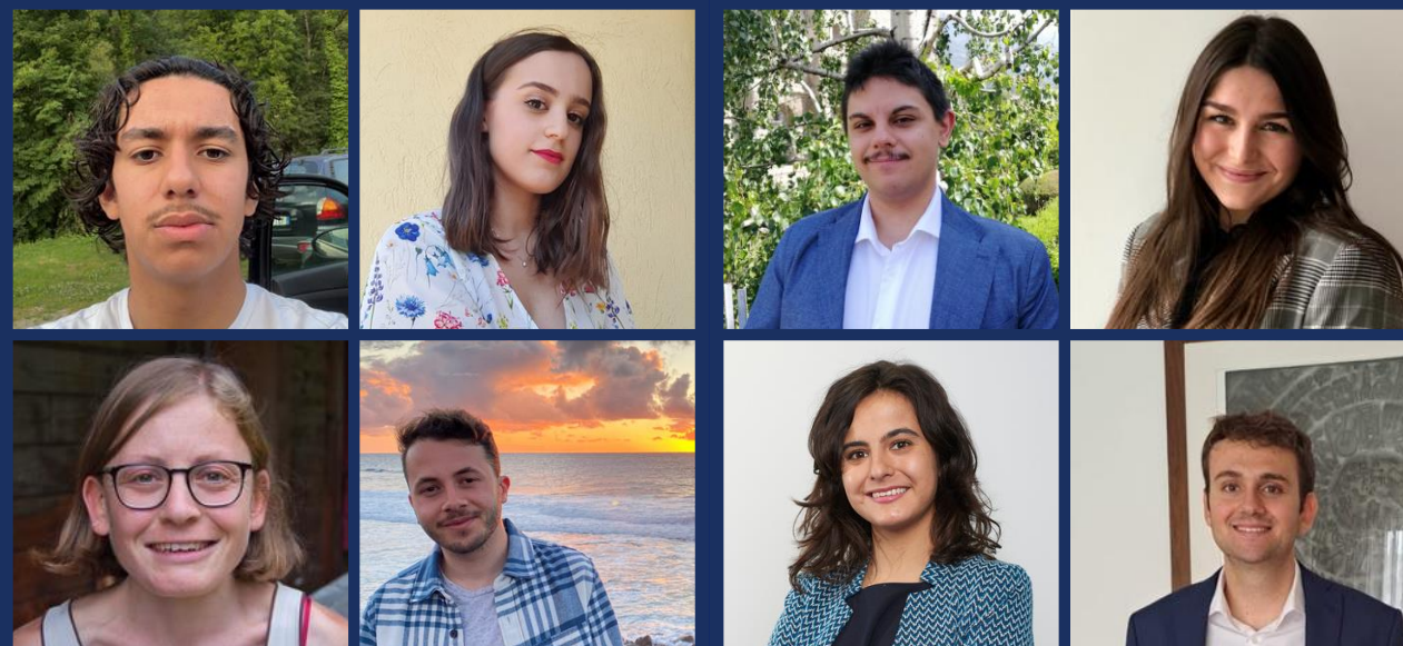
CONSEIL DES JEUNES ALCOTRA 2023-2024 UNE EXPÉRIENCE UNIQUE POUR LES PROGRAMMES EUROPÉENS TRANSFRONTALIERS